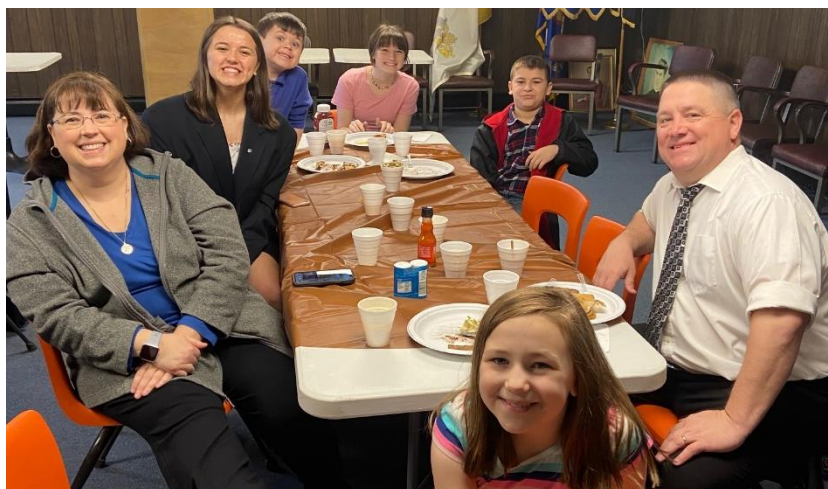
We had a wonderful breakfast last month! Thank you to all who attended and helped out!

Hope everyone is doing well and recovering from all the Easter activities. April was a very busy month, and I'm very happy to report on what is going on with the Council and the Hall. First of all, I want to thank everyone for coming out the beginning of the month to clean out the Hall, the place looks great. We got the contractor coming in next month to work on the exterior of the building to make it look more presentable. The communion breakfast was a rousing success. I can't thank the committee enough for the wonderful job that they did putting it together. I do believe we have two new members from Maternity just because we showed up on Sunday and invited them to breakfast.